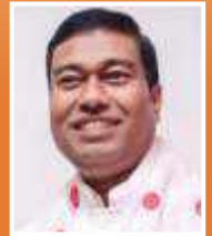
Rameswar Teli Minister of State, Food Processing Industries