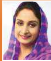
Harsimrat Kaur Badal Minister of Food Processing Industries