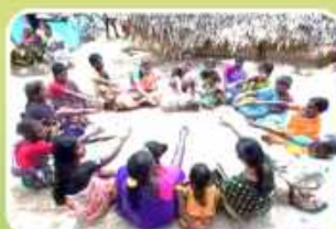
Support to FPOs/ SHGs/ Cooperatives