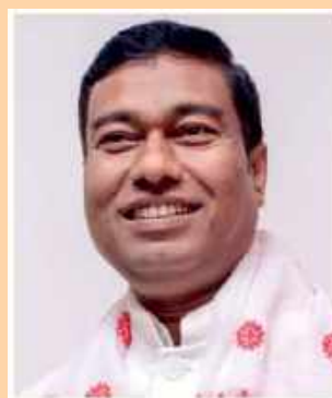
Rameswar Teli Minister of State, Food Processing Industries