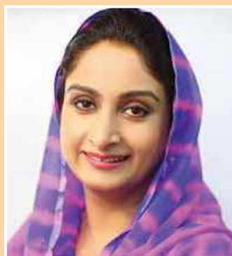
Harsimrat Kaur Badal Minister of Food Processing Industries