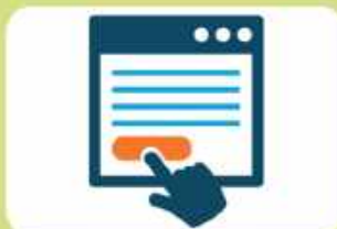
Application for the Subsidy