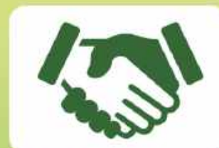
Branding & Marketing