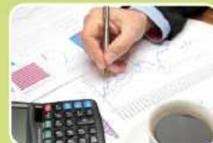
DPR and FUPs